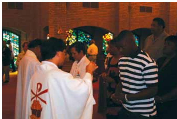
Priests, deacons and other religious ministered to more than 72,000 Catholics in our 51 parishes and missions in 2010-11.